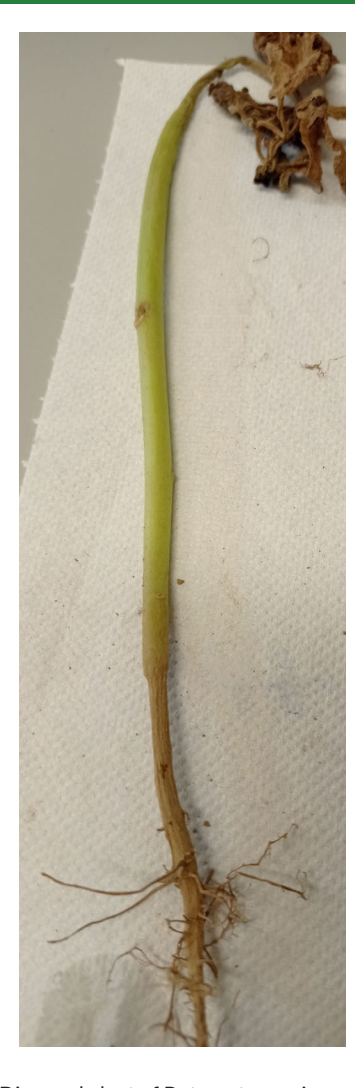
FIGURE 1 Diseased plant of Datura stramonium collected in the field and used to isolate MIAE08148