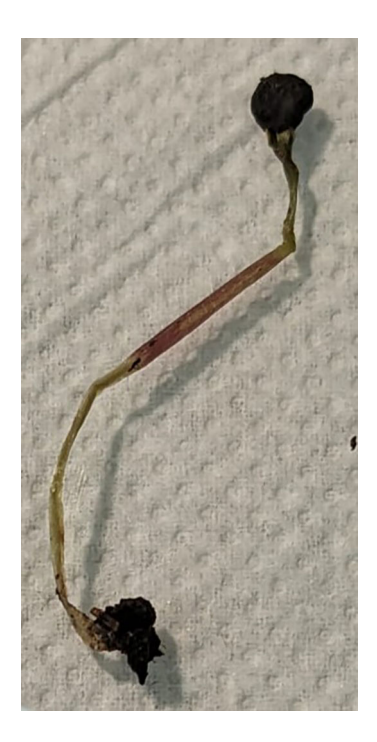
FIGURE 5 Plant inoculated with isolate MIAE08148 collected 17 days after inoculation