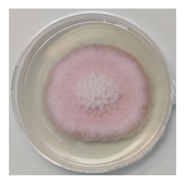
FIGURE 2 Colony morphology of isolate MIAE08148 on potato dextrose agar