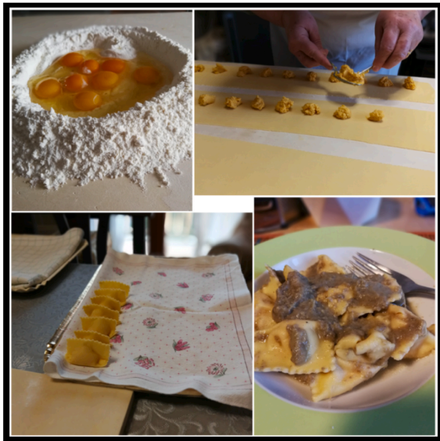
Fig. 3. Preparing homemade ravioli with the neighbour.

we noticed that these basic food products accounted for the majority of FQS purchased by participants. Importantly, when asked about the reasons behind the purchase of these specific FQS products, participants revealed that the labels were not the reason why the products were bought. Participants were almost never aware of the presence (or the meaning) of the PDO/PGI logos on their staple foods; in other words, participants bought products they knew and liked for their characteristics, or for their attachment to that ingredient, and not because of the logo, a similar finding to that reported by Eden et al. (2008). A German participant explained that he did not pay attention to the quality label, or "subconsciously maybe, but not in a way that I would have reacted to it [PDO label]"(GE1).