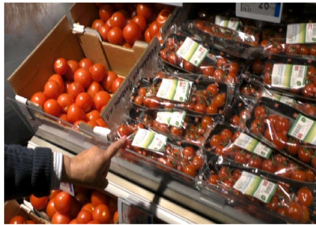
Fig. 2. An example of purchasing practices.

of routinised behaviour characterized Claire, a British mother (UK4) who moved to the countryside with her family and started to buy groceries online, as she found it more convenient than reaching distant grocery stores. Our participants became more reflexive of food practices following these major life changes and identified online shopping as a constraint to paying any attention to quality labels, compared to a physical store situation where consumers can pick up a product and check carefully its packaging. The major changes in their lives (e.g. changing jobs and/or residences) generated changes in their ordinary food consumption, which they reflexively identified as lacking the opportunity to engage with FQS labels.