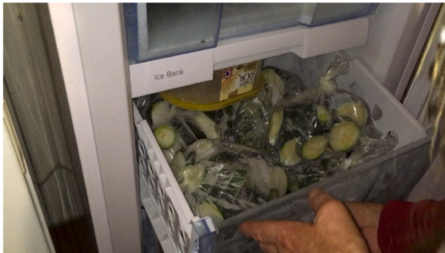
Fig. 1. The courgette fridge.

was produced by them, we consider it as a very high-quality product and try to prepare something special' (HU4). This, in turn, highlights an interesting juxtaposition between 'labelled' and 'non-labelled' food, whereby participants considered local, non-labelled products as of higher quality and more trustworthy, and revealed a greater level of material and affective engagement with them. In the words of one participant: