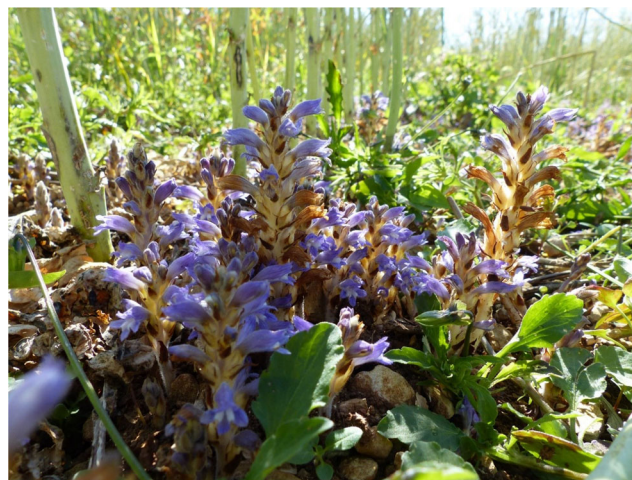
Fig. 1 Example of a Phelipanche ramosa (branched broomrape) parasitic plant in a winter rapeseed field in the Deux-Sèvres “department” (France)

Some weedy species directly reduce crop biomass through a parasitic strategy (Fig. 1). Parasitism is a very successful life strategy: the parasite bypasses all of its host’s structural and immune defenses and extracts all the resources it needs while keeping its host alive to complete its cycle (Westwood et al. 2010; Poulin 2014). This close interaction between the parasite (a parasitic weed in the present case), and its host (a cultivated plant), makes pest control particularly complex.